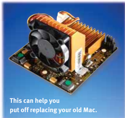
This can help you put off replacing your old Mac.

The Extreme's power boost was most apparent in processor-intensive tasks such as QuickTime compression and multitracked GarageBand software instruments. Running on the Extreme, QuickTime encoded a DV file into MPEG-4